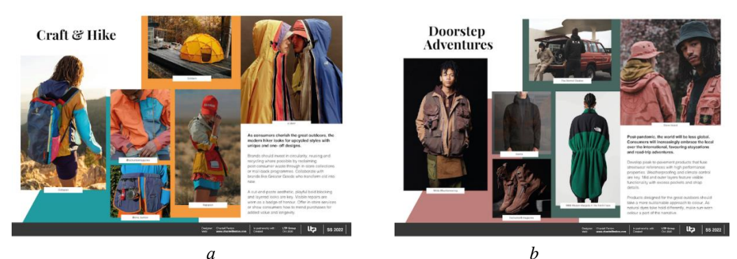
Fig. 2, a-b. Craft & Hike Trend Board (a), Doorstep Adventure Trend Board (b) (2022), (image source: www.chantellfenton.com)