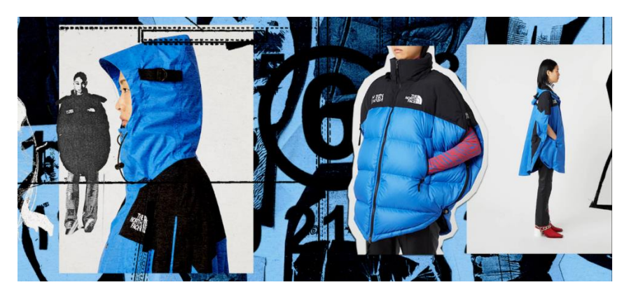
Fig. 1. MM6 Maison Margiela X The North Face (2022) (image source: http://www.maisonmargiela.com)

So, in particular, the forecast proposals of leading outdoor brands regarding leading fashion concepts for short-term and current fashion trends, published on their official websites (Fig. 1-3) (Ltp Group, 2022), deserve special attention.