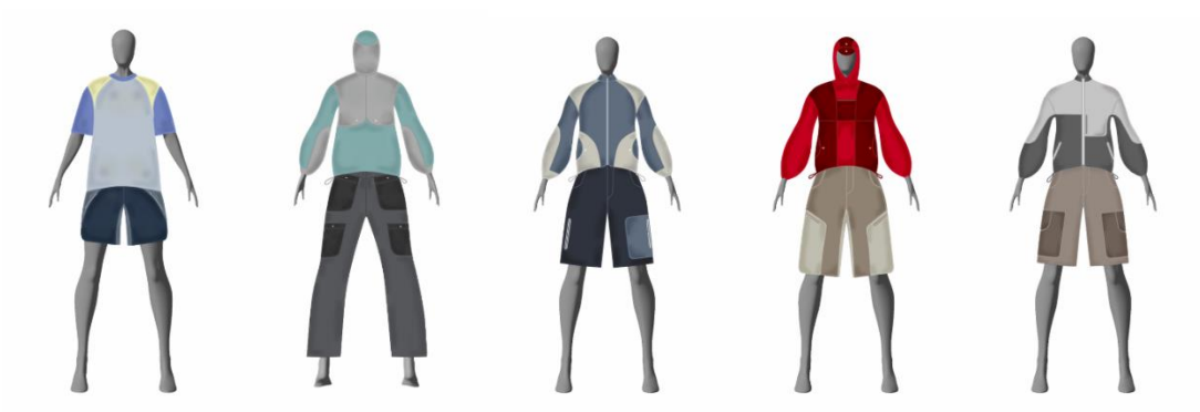
Fig. 4. Sets of everyday youth outdoor clothing

The presented clothing sets can be used in the hectic conditions of everyday life. Clothing will be comfortable both for normal walks and for a more active life, skateboarding, cycling, etc. – that is, clothing can be used daily (Fig. 4). In these products, you can feel comfortable and safe during night antics and adventures. At the same time, it creates a sense of secrecy and helps to hide your identity.